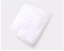
A. White paper