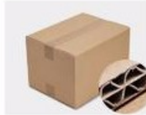
G. Five layer Corrugated paper master carton