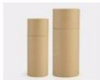
L. Paper Sleeve