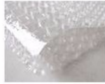
C. Bubble paper