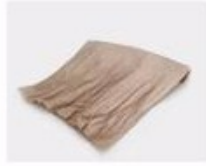
B. Corrugated paper