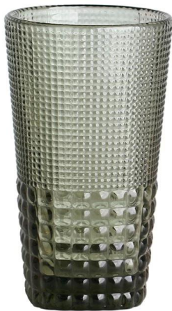
Tall Textured Tumbler Size: T8.2*D6*H14.5cm Capacity: 440ml/15oz. Weight: /g