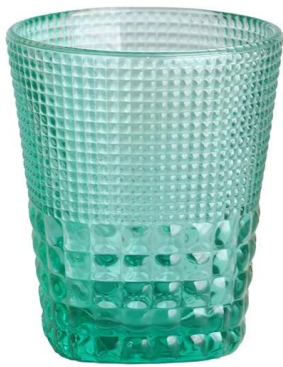
Textured Tumbler Size: T8.7*B6.3*H10cm Capacity: 300ml/10oz Weight: 378.5g