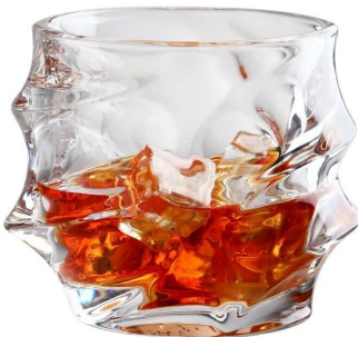
Whiskey Glass-B Size: T9.2*D7.5*H9.2cm Capacity: 330ml Weight: 522.1g