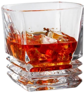
Whiskey Glass-D Size: T8.8*D5.8*H9.2cm Capacity: 270ml Weight: 380g