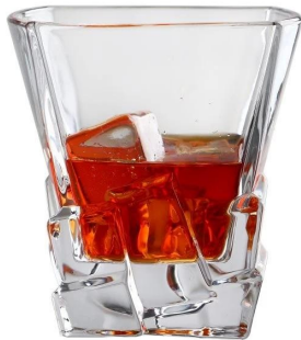
Whiskey Glass-C Size: T9*D5.9*H10cm Capacity: 300ml Weight: 464.5g