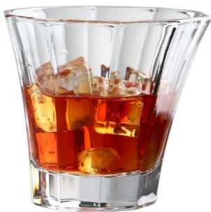
Whiskey Glass-A Size: T6.5*D6.5*H10cm Capacity: 270ml Weight: 325.7g