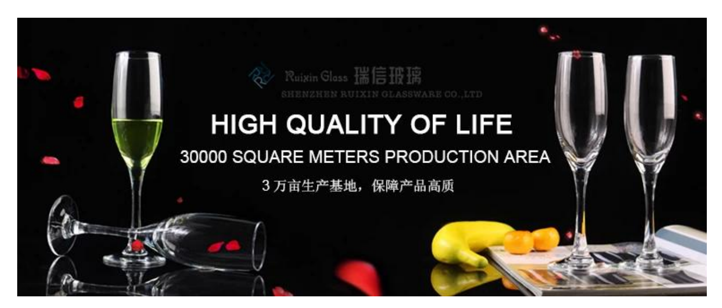
What are the features of wedding champagne flutes?