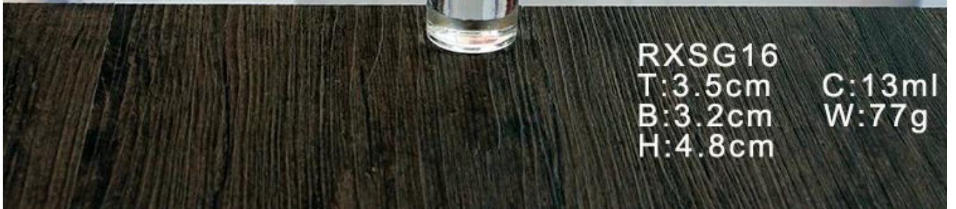
Thick Bottom Shot Glasses