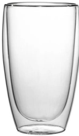
RXSC2004 Size: T8.2cm*H14.5cm Capacity: 480ml./16oz. Weight: 206g