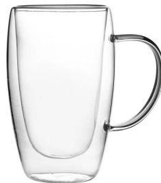
RXSCB3005 Size: T8.2cm*H14.5cm Capacity: 480ml./16oz. Weight: 217g