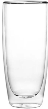
RXSC2005 Size: T9cm*H20cm Capacity: 650ml./22oz. Weight: 346g