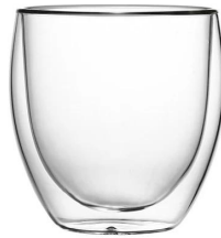
RXSC2002 Size: T8cm*H8.8cm Capacity: 250ml./8oz. Weight: 110g