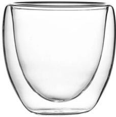
RXSC2001 Size: T6cm*H6cm Capacity: 80ml./3oz. Weight: 85g