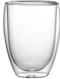
RXSC2003 Size: T8cm*H11.5cm Capacity: 380ml./12oz. Weight: 190g