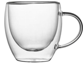
RXSCB3003 Size: T8cm*H8.8cm Capacity: 250ml./8oz. Weight: 143g