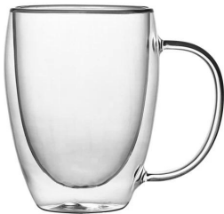
RXSCB3004 Size: T8cm*H11.5cm Capacity: 380ml./12oz. Weight: 194g