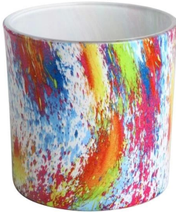
RXCD2405U05-L Size: T11.9*B11*H12.1cm Capacity: 860ml Weight: 806.5g