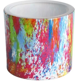
RXCD2405U05-S Size: T9*B8.4*H8cm Capacity: 270ml Weight: 444.7g