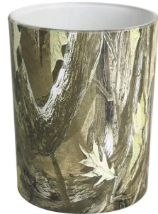
RXCD2405U04-C Size: T10*B8.9*H12.3cm Capacity: 630ml Weight: 512.3g