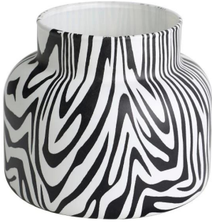
RXCD2405U03 Size: T8.1*B12.1*H10cm Capacity: 290ml Weight: 224.5g