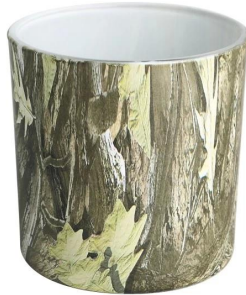
RXCD2405U04-B Size: T10*B9.3*H10cm Capacity: 535ml Weight: 417.2g