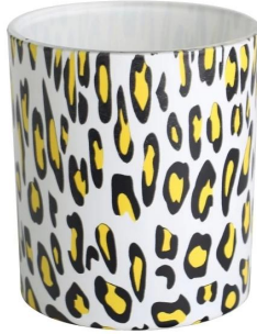
RXCD2405U01 Size: T7.9*B7.4*H9cm Capacity: 290ml Weight: 242.1g