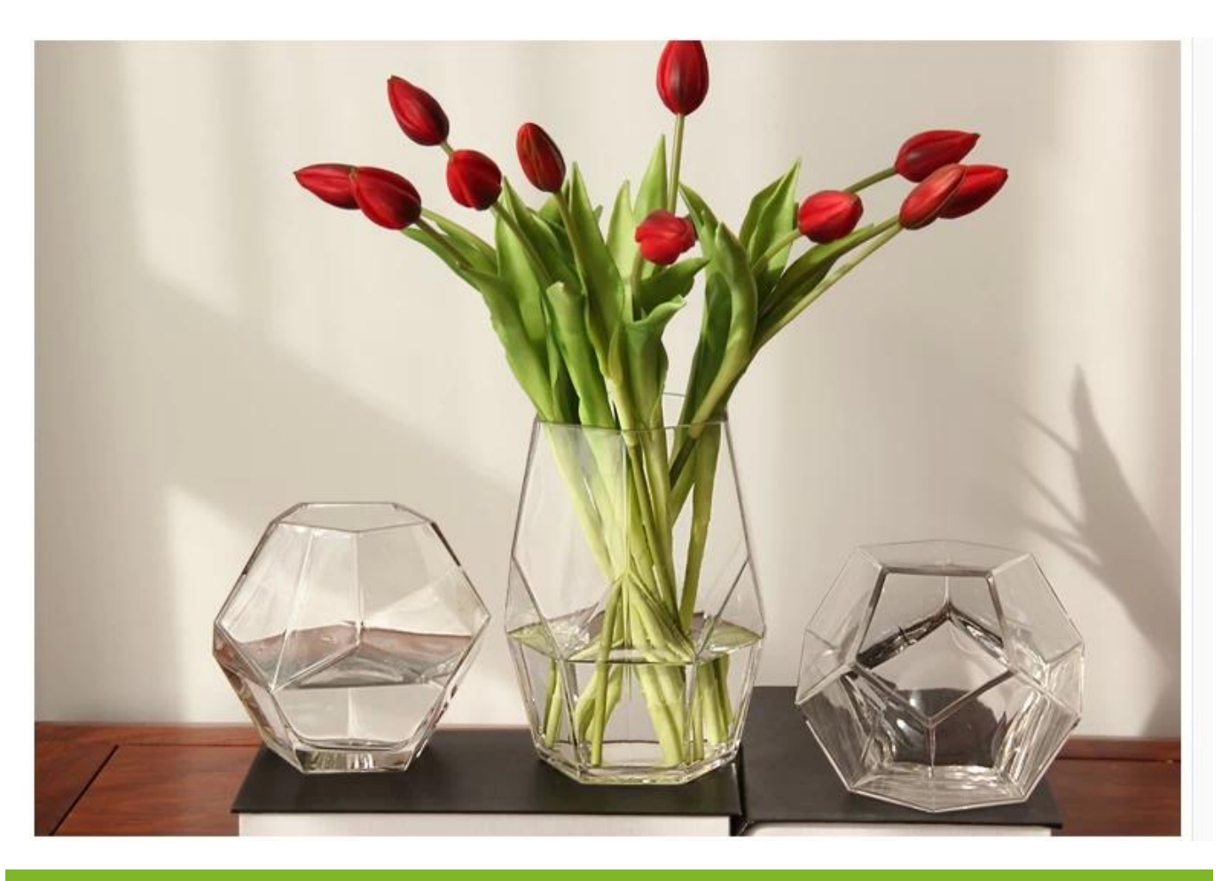
What are the unique vases applications?