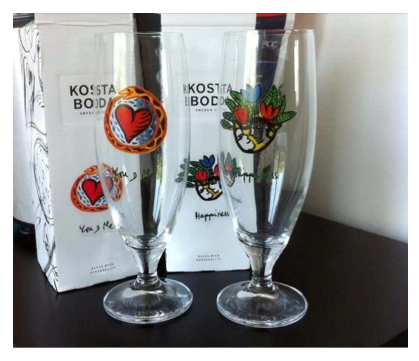
What are the transparent mugs applications?