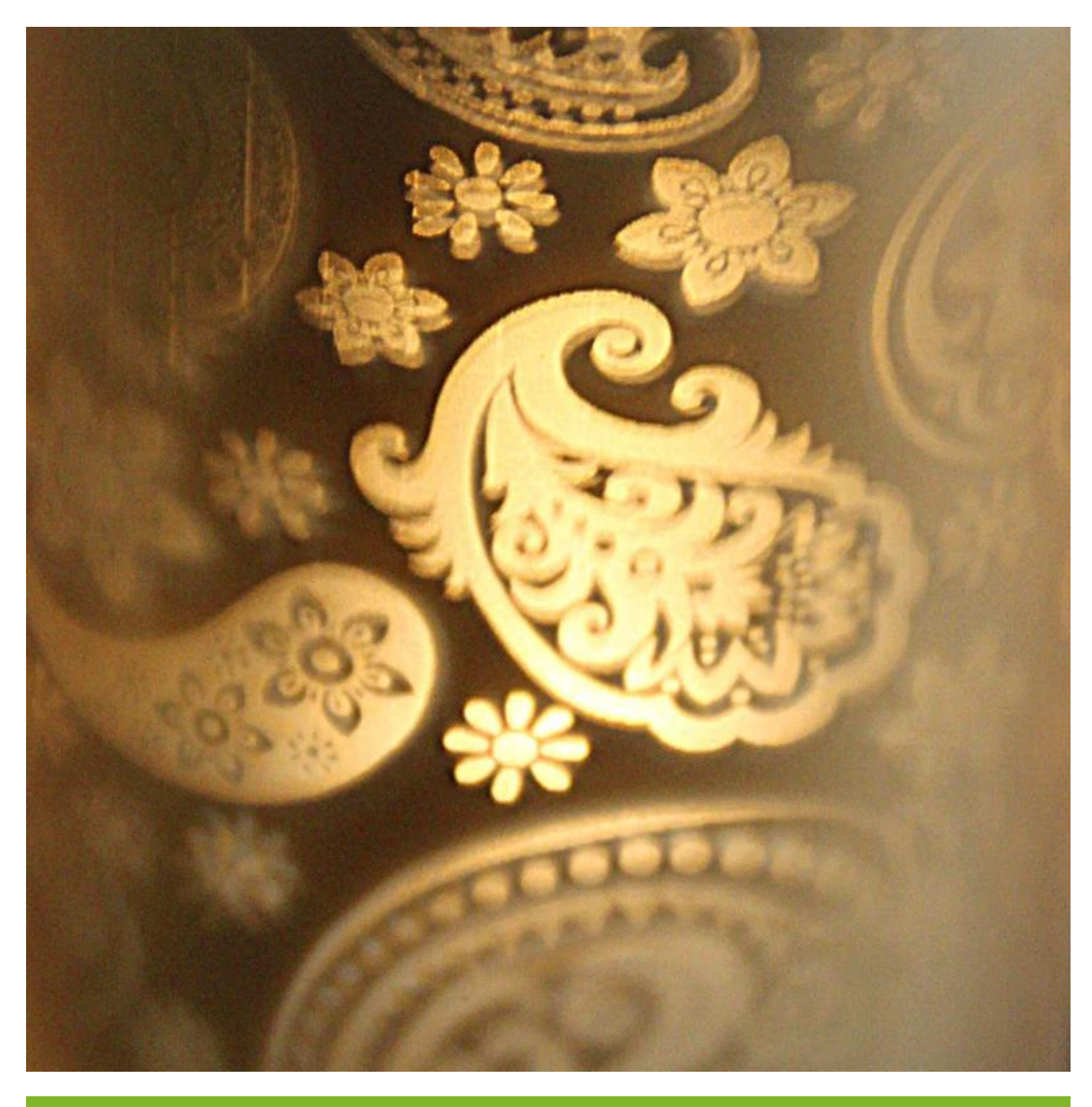
What are the stained glass candle holders applications?