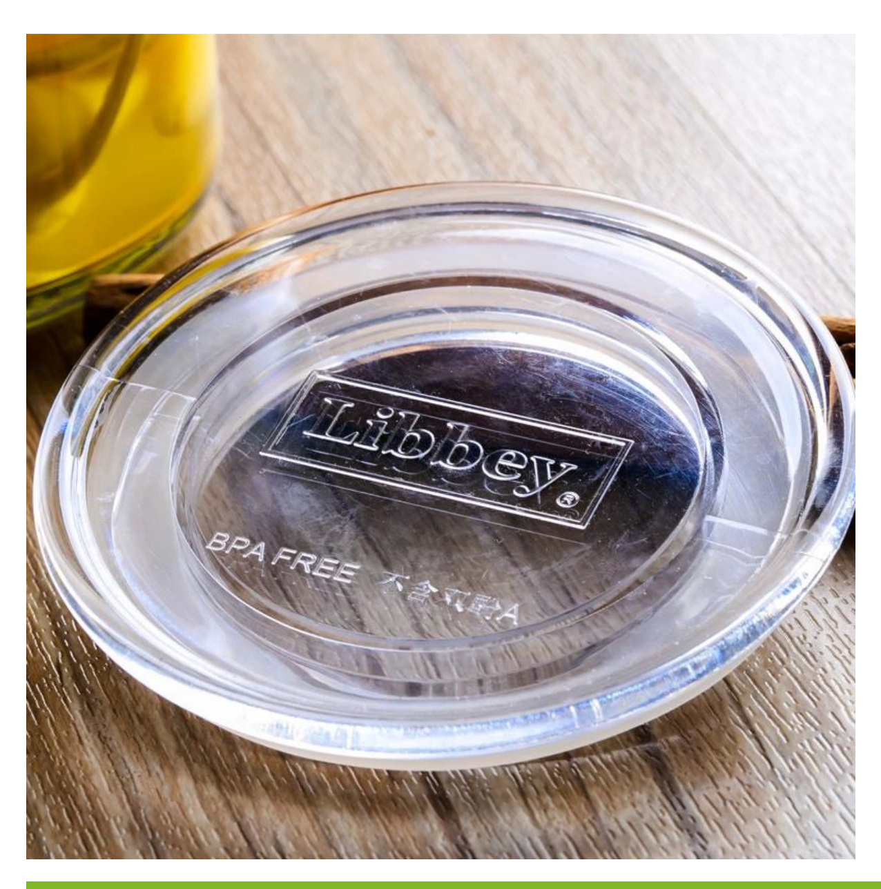
What are the glass vials applications?