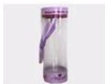
M. Pvc Box