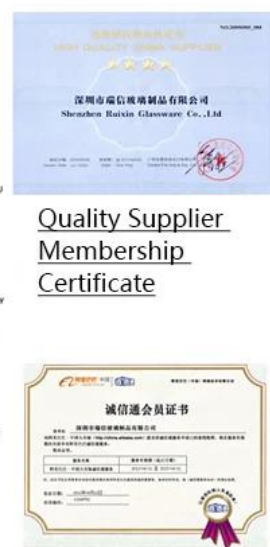
Alibaba TrustPass Membership Certificate