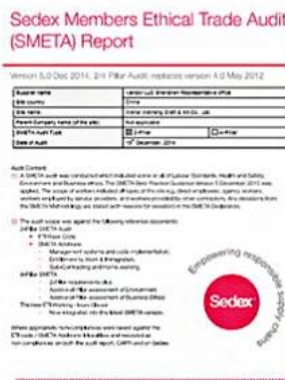
Sedex Verify factory certificate