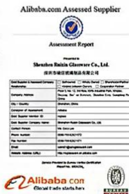
BV Verify factory