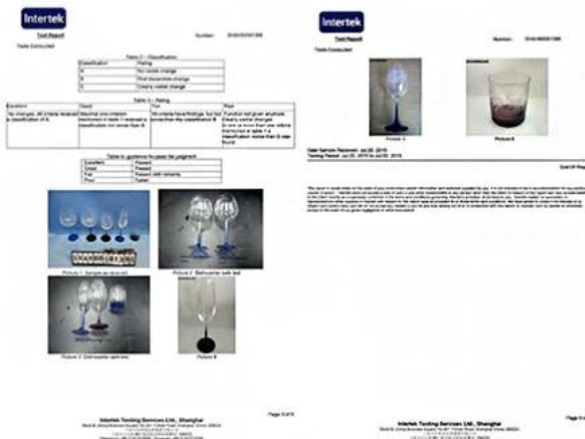
Spray glass cup dishwasher test report