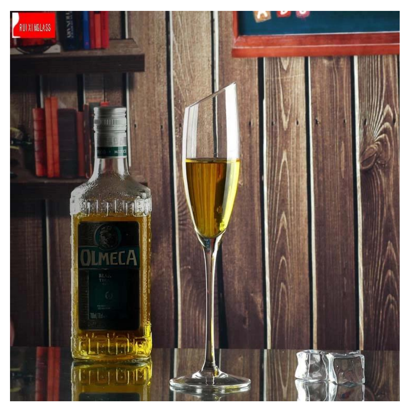
Who are we?