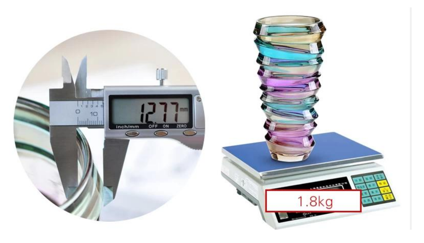
What are the glass vases applications?