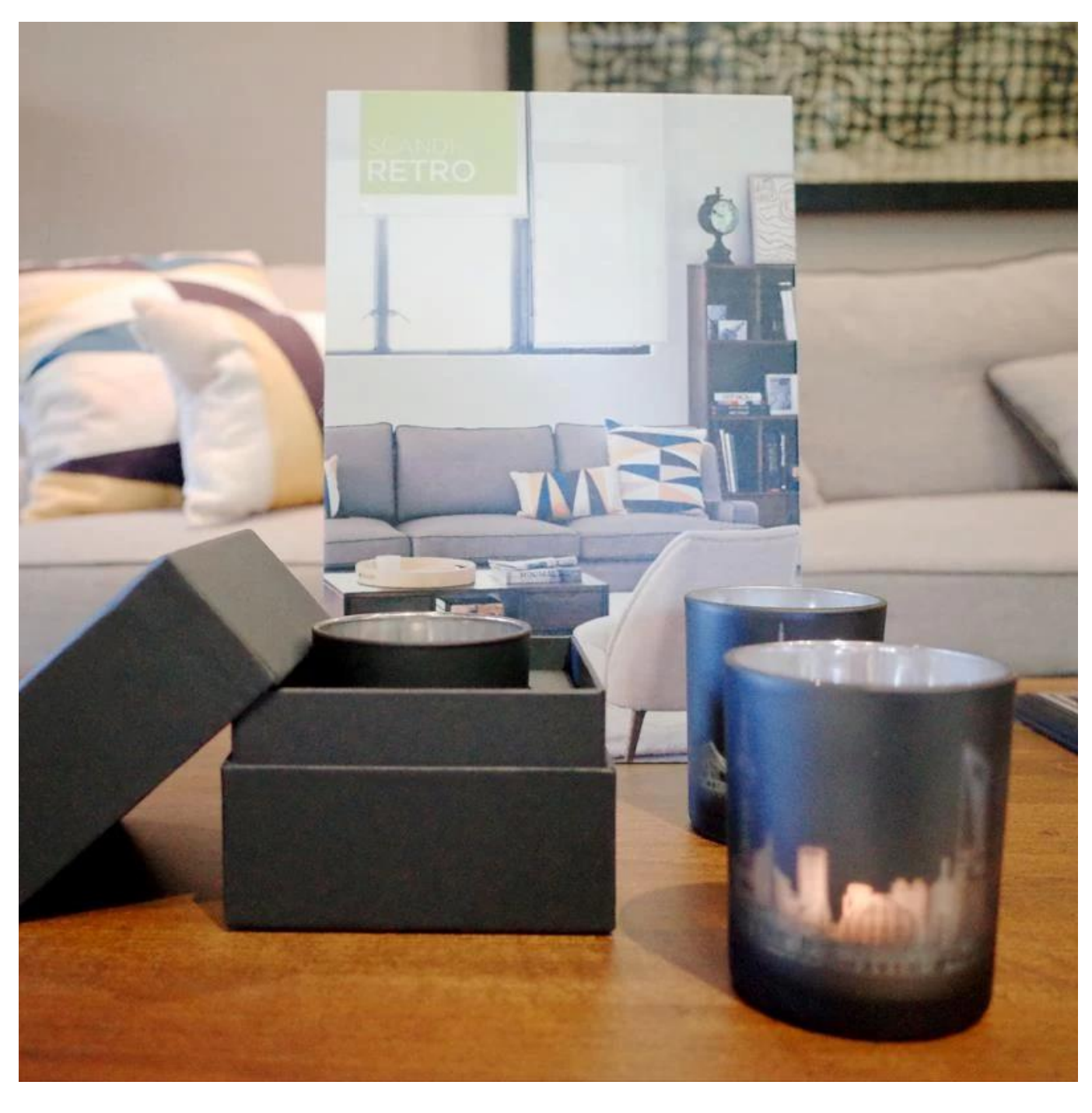
Who are we?