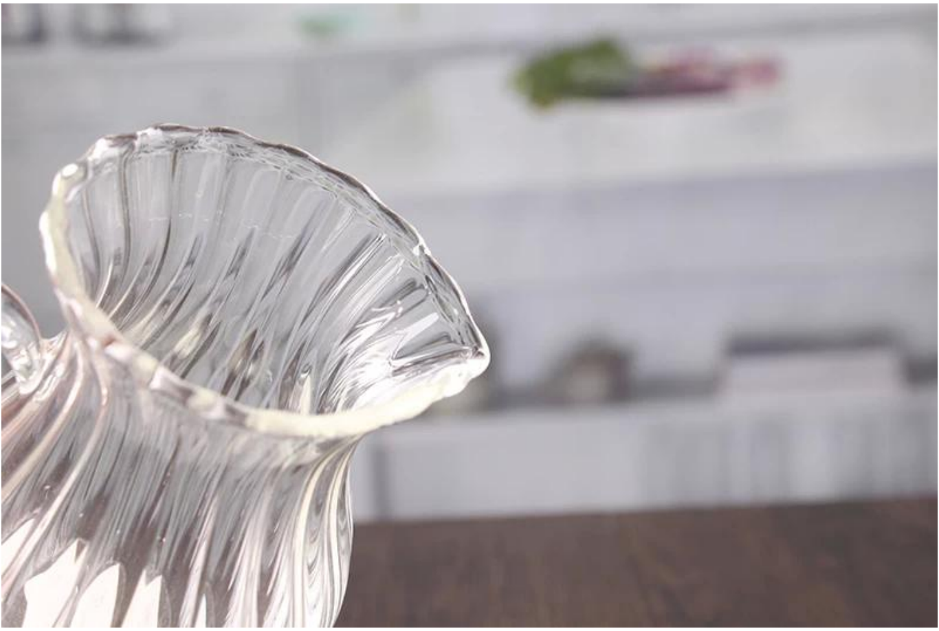
Low price small glass wine decanter with handle for sale