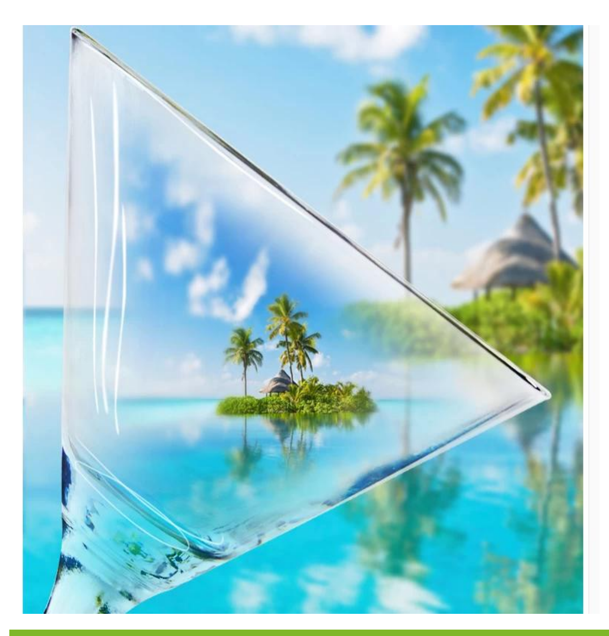
What are the martini glasses applications?