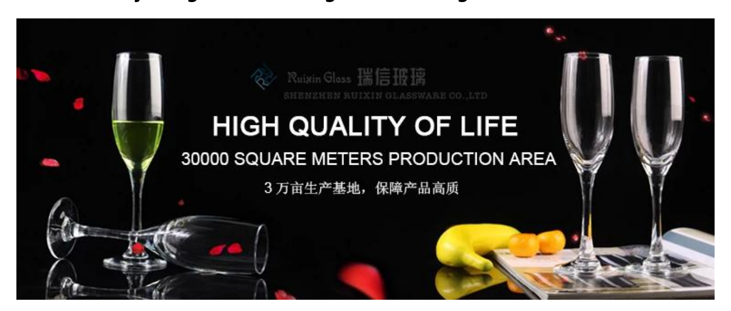
What are the features of martini glasses?