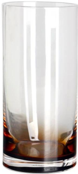
RXXZ30146-1 Size: T7.3*B7.2*H16cm Capacity: 510ml Weight: 334.5g