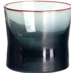
RXXZ31144-1 Size: T8.4*B7.8*H7.6cm Capacity: 170ml Weight: 370g