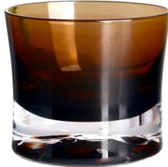
RXXZ31144-2 Size: T8.4*B7.8*H7.3cm Capacity: 170ml Weight: 367g