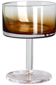
RXXZ29258-A Size: T8.8*B7.9*H12.5cm Capacity: 200ml Weight: 300g