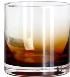
RXXZ30146-3 Size: T8.3*B8.3*H8.5cm Capacity: 320ml Weight: 307g