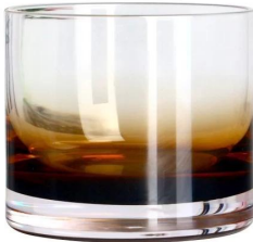
RXXZ30146-4 Size: T8*B8*H7cm Capacity: 315ml Weight: 304g