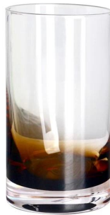
RXXZ30146-2 Size: T8.5*B6.5*H12cm Capacity: 275ml Weight: 284g