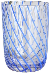
RXDL73 Size: T8*Ø5*H11.5cm Capacity: 400ml Weight: 171g