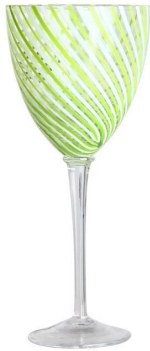
RXNZ38-A Size: T9.4*Ø6.9*H12.1cm Capacity: 350ml Weight: 235g