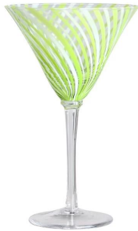
RXNZ38-B Size: T11.6*Ø7.5*H19.1cm Capacity: 230ml Weight: 208g