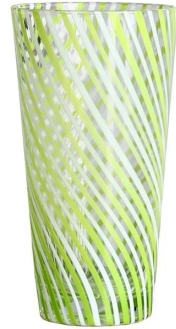
RXNZ38-C Size: T8.1*Ø5.3*H15.1cm Capacity: 440ml Weight: 230g