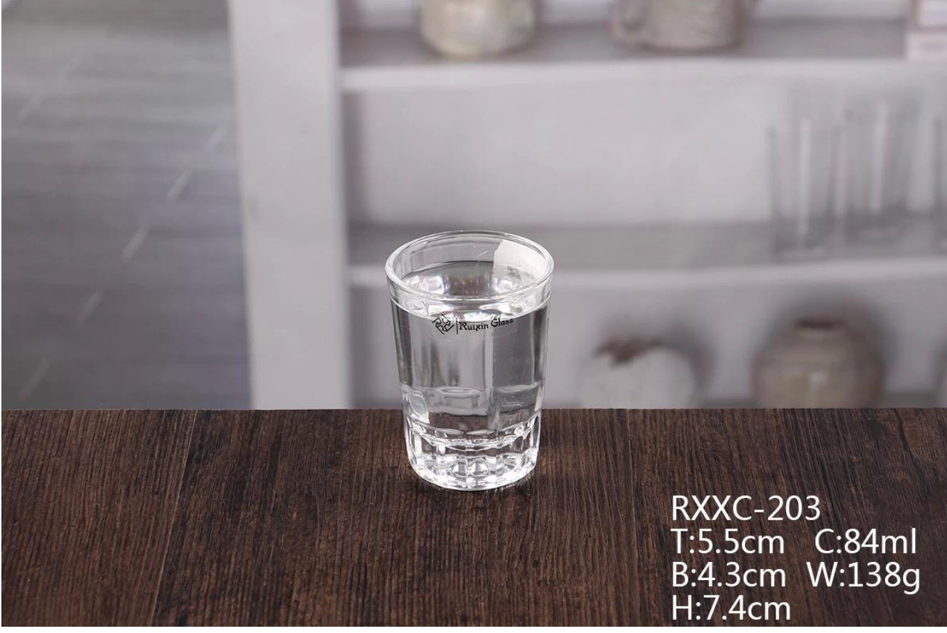
Hot sale 3 oz 84ml best shot glasses wholesale