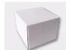
J. White Box