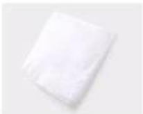
A. White paper