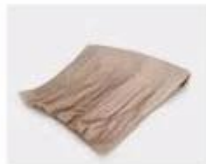
B. Corrugated paper