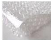
C. Bubble paper