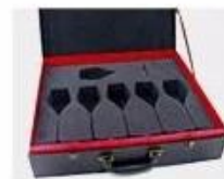
N. Gift Box