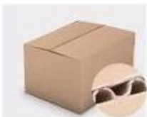
F. Three layer Corrugated paper master carton