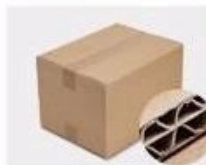
G. Five layer Corrugated paper master carton