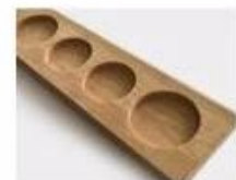
R. Wooden Pallet