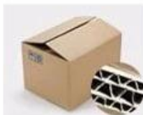
H. Seven layer Corrugated paper master carton