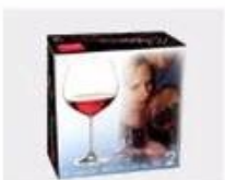
K. Color Box