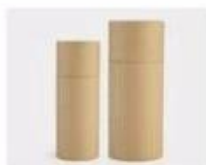
L. Paper Sleeve