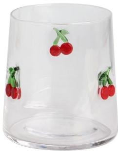
Spice jar-S Size: T6.9*P7.8*H8.6cm Capacity: 290ml/9.8oz Weight: 130g