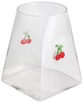
Spice jar-L Size: T7*P8.8*H11.4cm Capacity: 510ml/17oz Weight: 268.2g