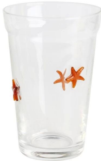
Tumbler Size: T8.5*B5.5*H13cm Capacity: 380ml/12.8oz Weight: 226.3g