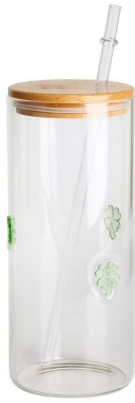
Smoothie Cup-L Size: T7.5*B7.5*H17.5cm Capacity: 655ml/22.1oz Weight: 262.8g