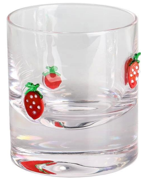
Whisky glass Size: 17.9*87.6*H9cm Capacity: 230ml/7.8oz Weight: 516.4g