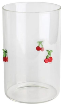
Glass jar-A Size: T6.5*P6.5*H10cm Capacity: 325ml/11oz Weight: 140g