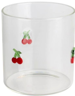
Glass jar-B Size: T6.5*P6.5*H6.5cm Capacity: 185ml/6oz Weight: 120g