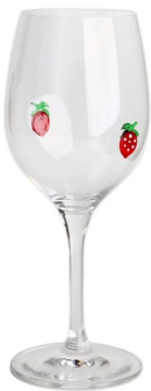
Wine glass-D Size: 16.9*88*H21.3cm Capacity: 475ml/16oz Weight: 175.2g