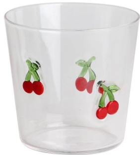
Glass jar-C Size: T8.5*P6.5*H8.2cm Capacity: 295ml/10oz Weight: 103.5g