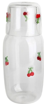
Water pitcher Size: T8.4*P7*H22.4cm Capacity: 1120ml/38oz Weight: 530g