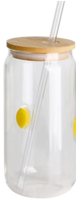
Smoothie Cup-M Size: T6.4*B4.5*H15.1cm Capacity: 550ml/18.6oz Weight: 157.1g