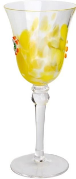
Goblet Size: 18.5*87.4*H20.1cm Capacity: 210ml/7.1oz Weight: 193.5g