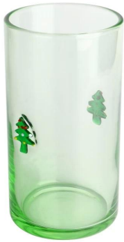
Highball Size: 17.7*87.7*H14.5cm Capacity: 515ml/14.5oz Weight: 324.5g