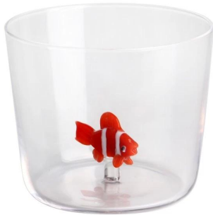
Glass bowl-S Size: T10.3*B6.2*H8.6cm Capacity: 500ml/16.9oz Weight: 164.3g