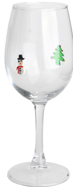
Wine glass-C Size: 16.1*87.4*H20.1cm Capacity: 350ml/11.8oz Weight: 177.1g