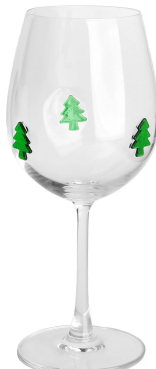
Wine glass-B Size: 17*88.3*H22.4cm Capacity: 565ml/19oz Weight: 218.3g