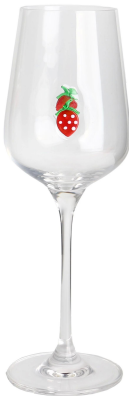
Wine glass-A Size: 15.9*87.5*H23.5cm Capacity: 350ml/11.8oz Weight: 164.4g