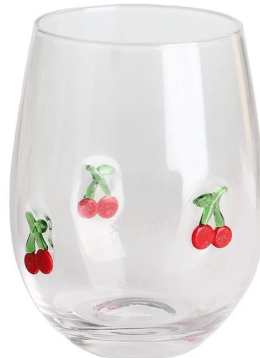
Stemless wine glass Size: 17*H12cm Capacity: 370ml/12.3oz Weight: 158.6g