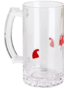
Beer mug Size: T8*B8*H15cm Capacity: 500ml/16.9oz Weight: 635g