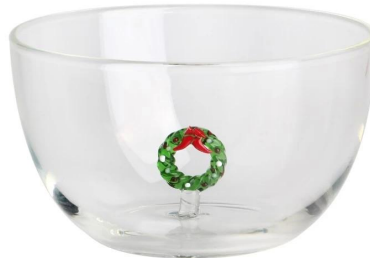
Glass bowl-L Size: T12.8*B7*H7.5cm Capacity: 625ml/21.1oz Weight: 211g