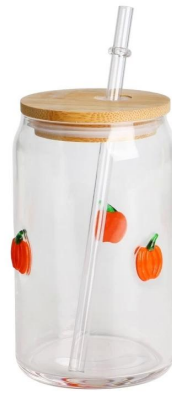
Smoothie Cup-S Size: T6.7*B7.2*H12.4cm Capacity: 440ml/14.9oz Weight: 204.5g