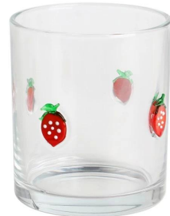
Candle jar Size: T7*B8.2*H6.7cm Capacity: 270ml/9.2oz Weight: 165g