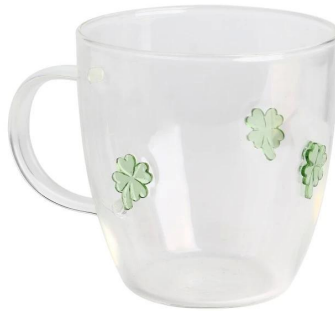
Coffee cup Size: T9.7*B6*H10cm Capacity: 495ml/16.7oz Weight: 140.1g