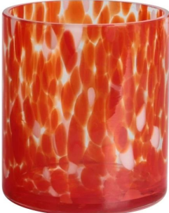
RXGQ1812 Size: T8*B8*H9cm Capacity: 270ml/6.9oz Weight: 270g