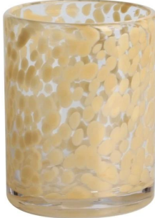
RXDS4115 Size: T8.1*B8*H10.3cm Capacity: 340ml/8.6oz Weight: 405g