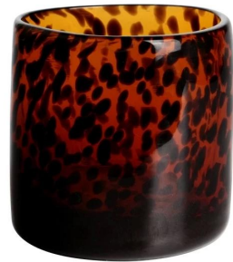
RXGQ2111 Size: T8*B8*H8cm Capacity: 240ml/6.1oz Weight: 339g