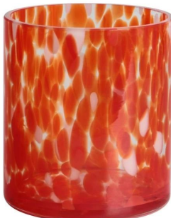
RXGQ1812 Size: T8*B8*H9cm Capacity: 270ml/6.9oz Weight: 270g