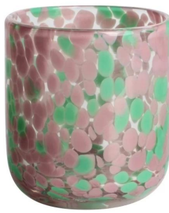
RXDS3611-8 Size: T8.1*B5*H9cm Capacity: 270ml/6.9oz Weight: 328g