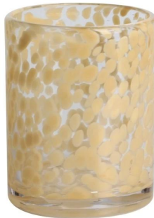
RXDS4115 Size: T8.1*B8*H10.3cm Capacity: 340ml/8.6oz Weight: 405g