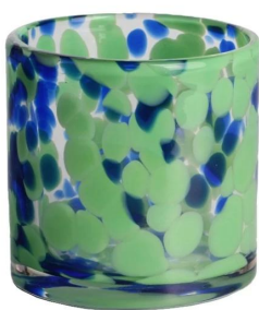
RXDS880 Size: T8*B7.9*H8cm Capacity: 250ml/6.4oz Weight: 324g