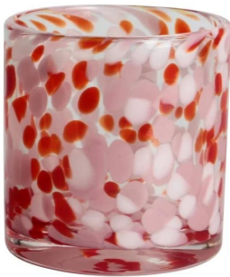
RXDS3711-1 Size: T8*B8*H8cm Capacity: 240ml/6.1 oz Weight: 375g