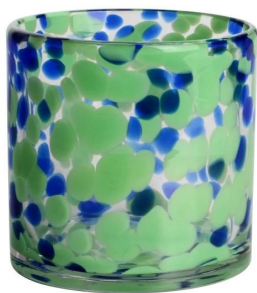
RXDS10100 Size: T10*B9.9*H10cm Capacity: 525ml/13.3oz Weight: 555g