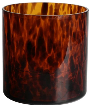
RXGQ12120 Size: T11.9*B11.8*H12cm Capacity: 1075ml/27.3oz Weight: 518g