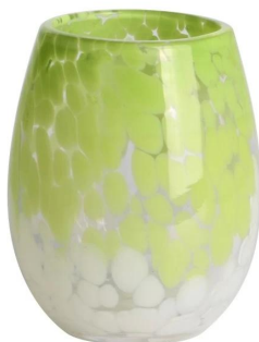
RXZL12 Size: T6.5*B5.5*H10.7cm Capacity: 425ml/11.6oz Weight: 351g