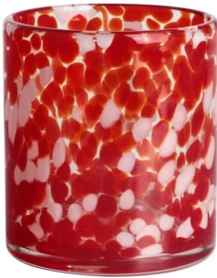
RXDS42115 Size: T8.8*B8.8*H9.8cm Capacity: 400ml/10.2oz Weight: 450g