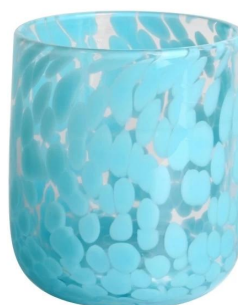
RXDS3611-7 Size: T7.7*B4.7*H8.9cm Capacity: 300ml/7.6oz Weight: 285g