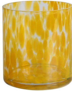
RXGQ5713 Size: T9*B9*H10cm Capacity: 500ml/12.7oz Weight: 394g