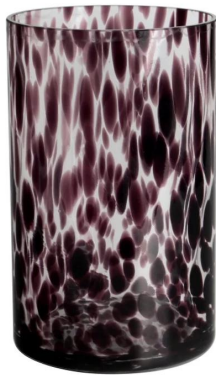
RXGQ1816 Size: T9*B9.8*H16cm Capacity: 910ml/23.1oz Weight: 583g