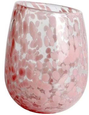
RXZL68 Size: T10.3*B6*H15.2cm Capacity: 1240ml/31.5oz Weight: 1062g