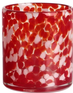
RXDS42115 Size: T8.8*B8.8*H9.8cm Capacity: 400ml/10.2oz Weight: 450g