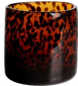
RXGQ2111 Size: T8*B8*H8cm Capacity: 240ml/6.1oz Weight: 339g