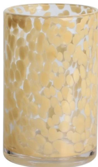
RXDS4112 Size: T8.1*B8*H12.7cm Capacity: 430ml/10.9oz Weight: 480g