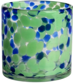
RXDS10100 Size: T10*B9.9*H10cm Capacity: 525ml/13.3oz Weight: 555g