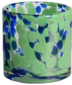
RXDS880 Size: T8*B7.9*H8cm Capacity: 250ml/6.4oz Weight: 324g