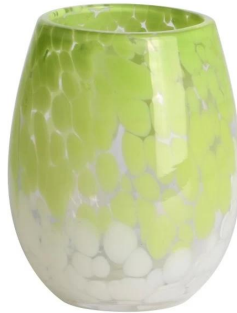
RXZL12 Size: T6.5*B5.5*H10.7cm Capacity: 425ml/11.6oz Weight: 351g