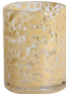
RXDS4115 Size: T8.1*B8*H10.3cm Capacity: 340ml/8.6oz Weight: 405g