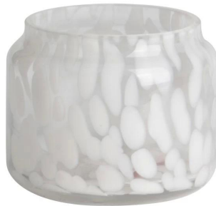
RXGQ78 Size: T7*B8.5*H6.7cm Capacity: 270ml/6.9oz Weight: 165g