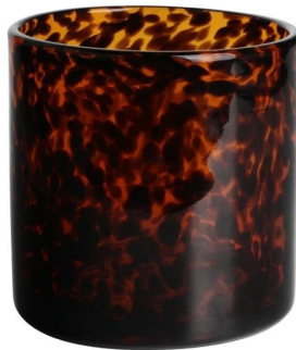
RXDS33135-4 Size: T10*B10*H10cm Capacity: 555ml/14.1oz Weight: 474g