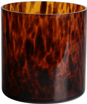
RXGQ12120 Size: T11.9*B11.8*H12cm Capacity: 1075ml/27.3oz Weight: 518g