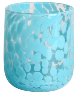
RXDS3611-7 Size: T7.7*B4.7*H8.9cm Capacity: 300ml/7.6oz Weight: 285g