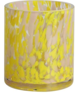
RXGQ3311 Size: T8*B8*H9cm Capacity: 270ml/6.9oz Weight: 430g