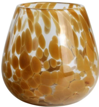
RXZL37 Size: T9*B7*H12.5cm Capacity: 850ml/21.6oz Weight: 835g