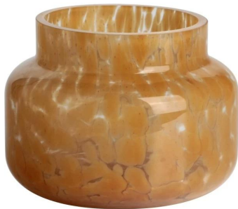
RXGQ500 Size: T7.9*B8.5*H8.3cm Capacity: 480ml/12.2oz Weight: 369g