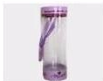
M. Pvc Box