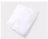
A. White paper