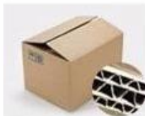
H. Seven layer Corrugated paper master carton