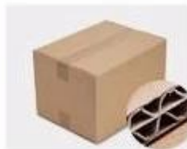
G. Five layer Corrugated paper master carton