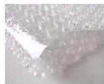
C. Bubble paper