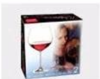
K. Color Box