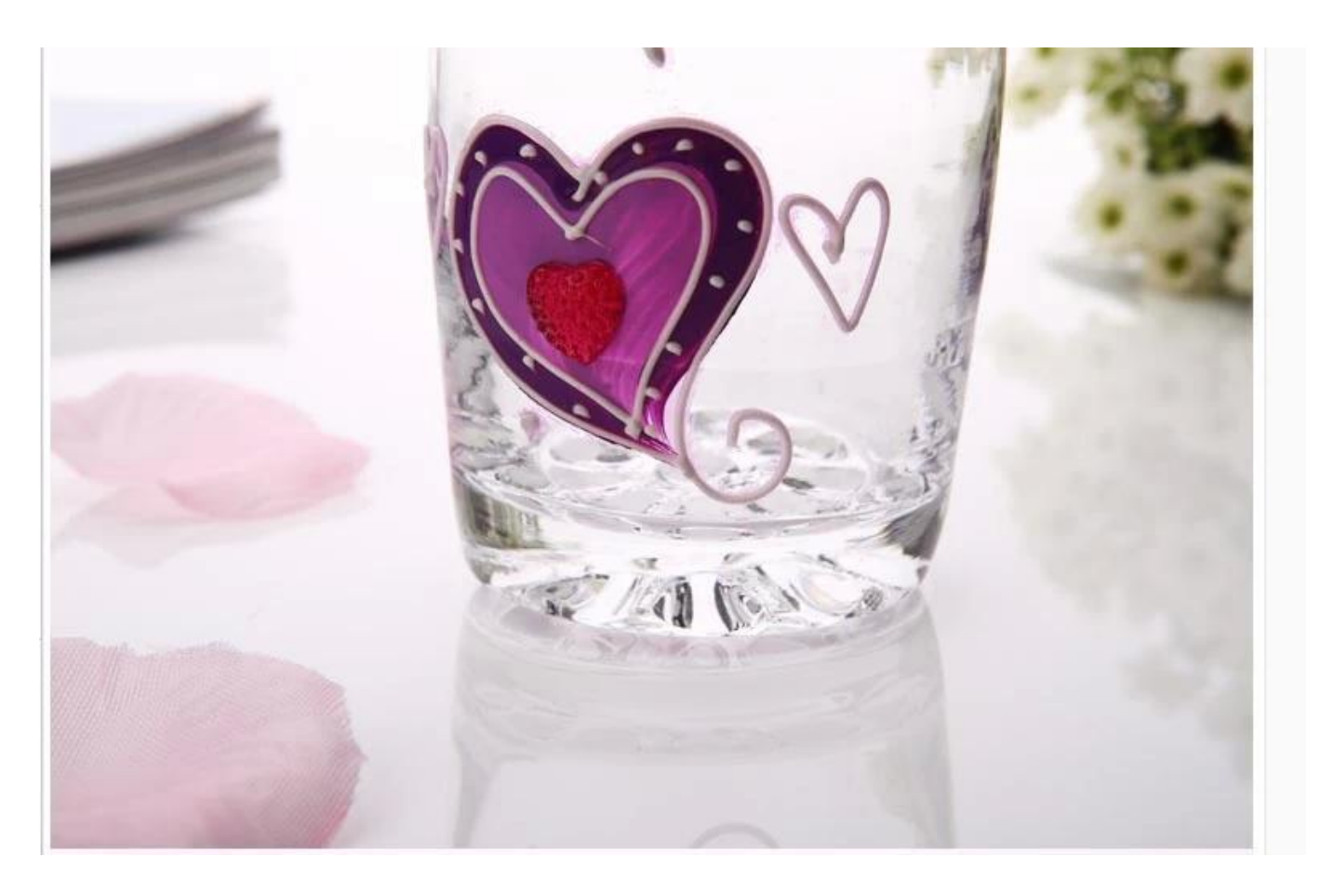
What are the glasses wine applications?