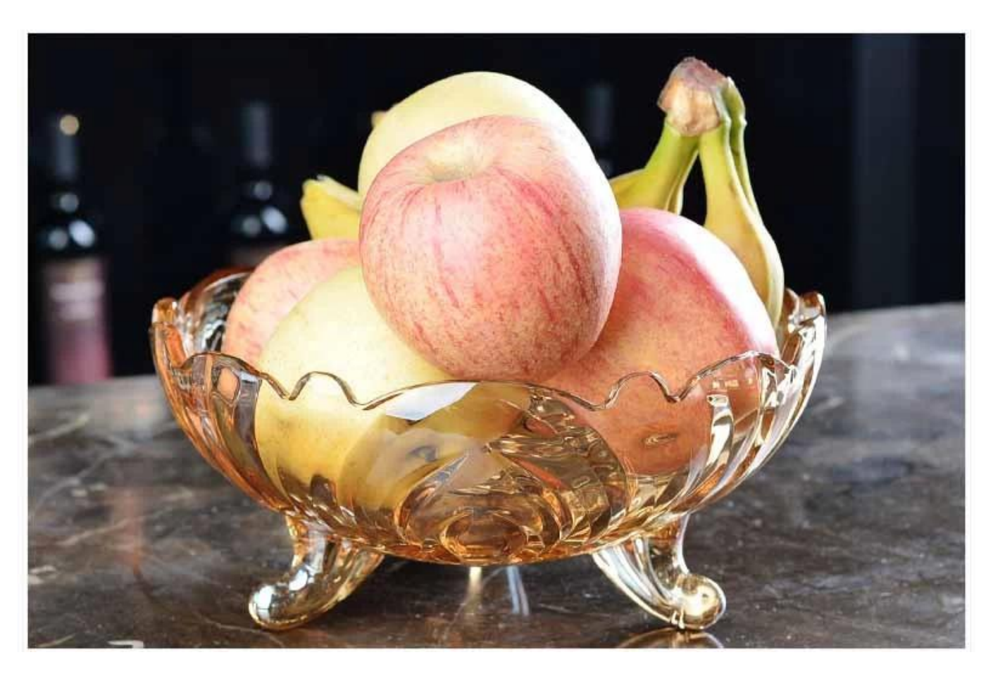
What are the glass bowls with feet applications?