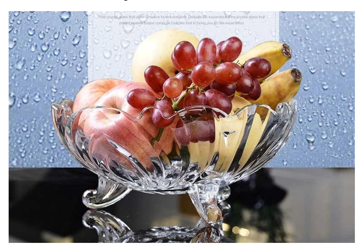
What are the functions of glass bowls with feet?