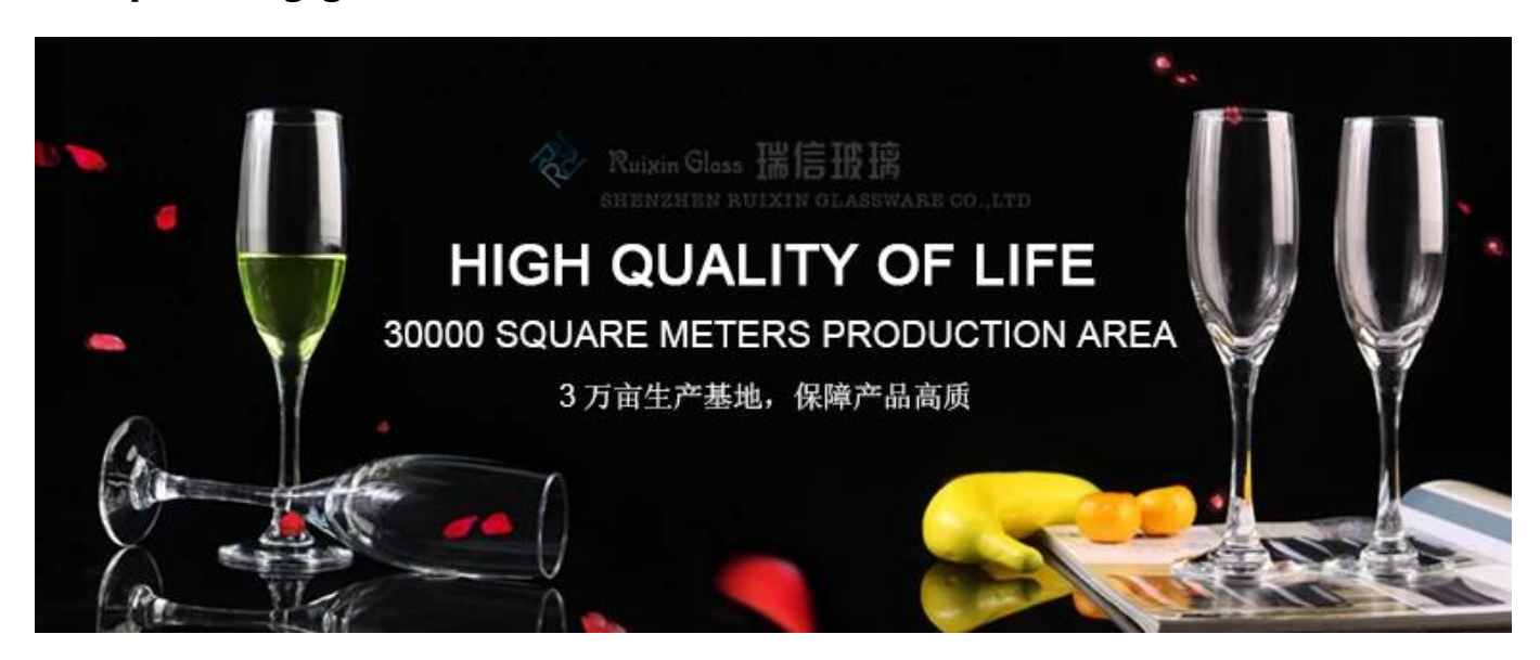
What are the features of glass bowls with feet?