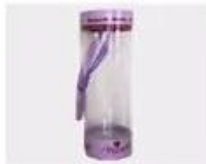
M. Pvc Box