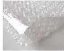
C. Bubble paper