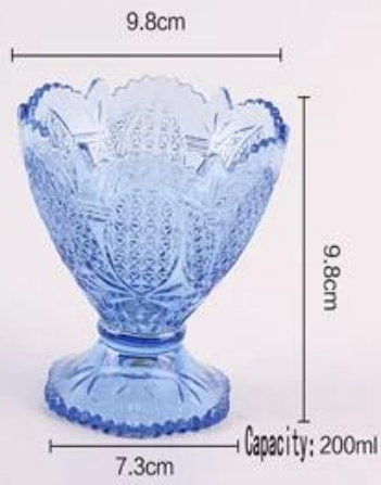
Blue lace style