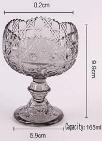
Gray lace style