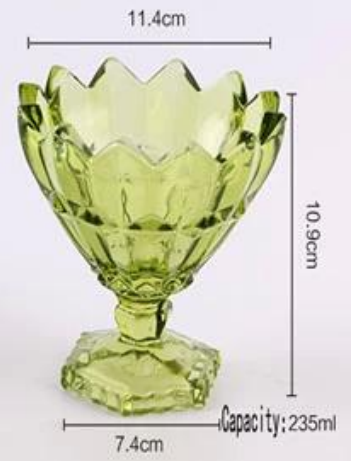
Green diamond style