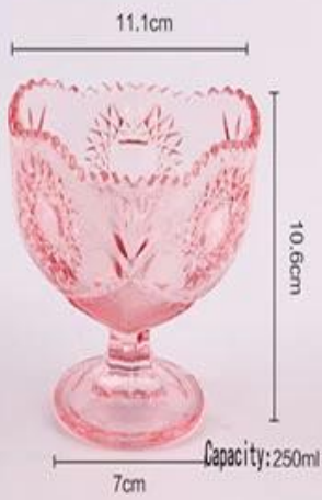
Pink Love Collection