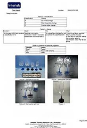
Spray glass cup dishwasher test report