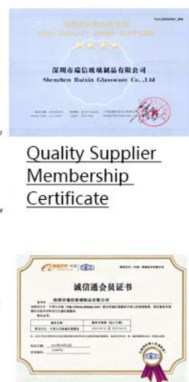
Alibaba TrustPass Membership Certificate