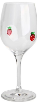
Wine glass-D Size: 16.9*88*H21.3cm Capacity: 475ml/16oz Weight: 175.2g