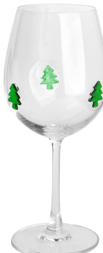
Wine glass-B Size: 17*88.3*H22.4cm Capacity: 565ml/19oz Weight: 218.3g