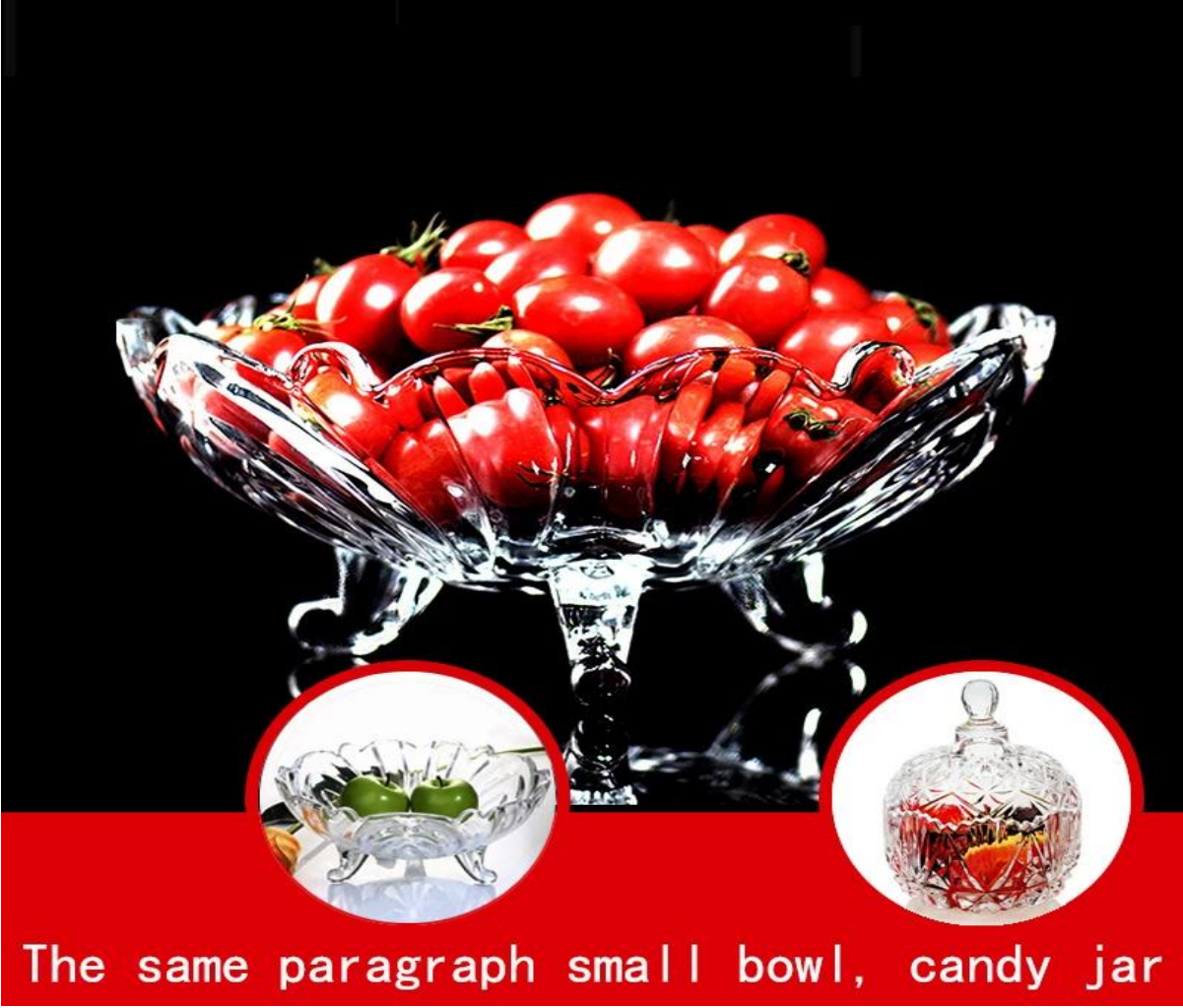
The same paragraph small bowl, candy jar