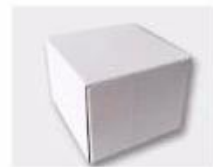
J. White Box