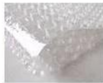
C. Bubble paper