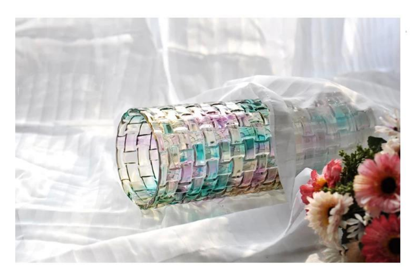
What are the customized glass vase applications?