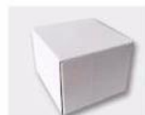
J. White Box