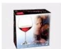
K. Color Box