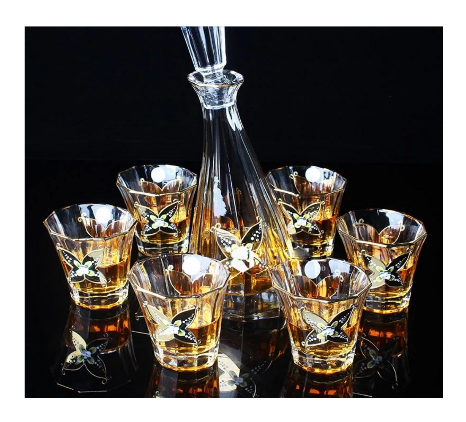
What are the whiskey glass sets applications?