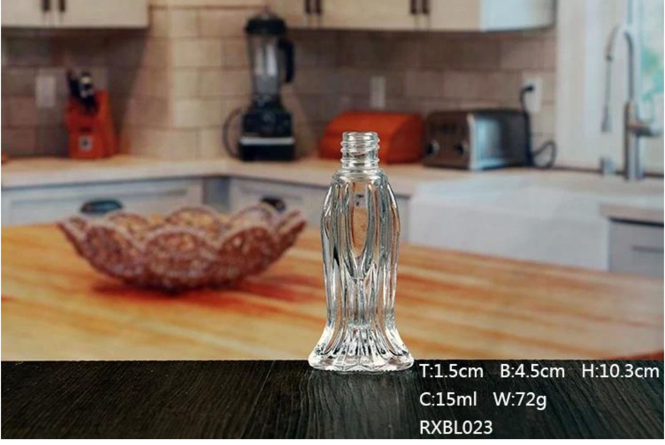
15ml empty perfume bottle