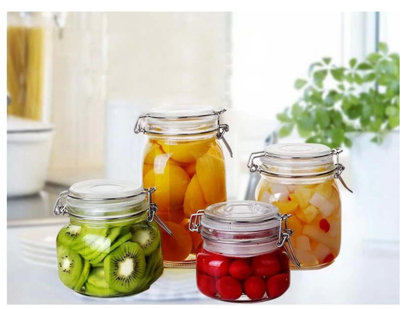
What are the functions of small glass jars?

1)Machine blasted /pressed, elegant pattern, widely use in restaurant/hotel/home/party etc.