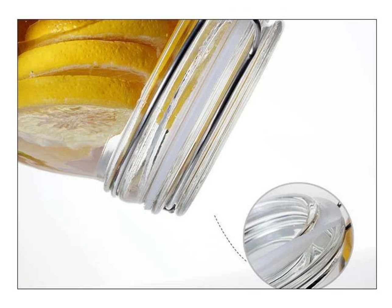
What are the small glass jars applications?