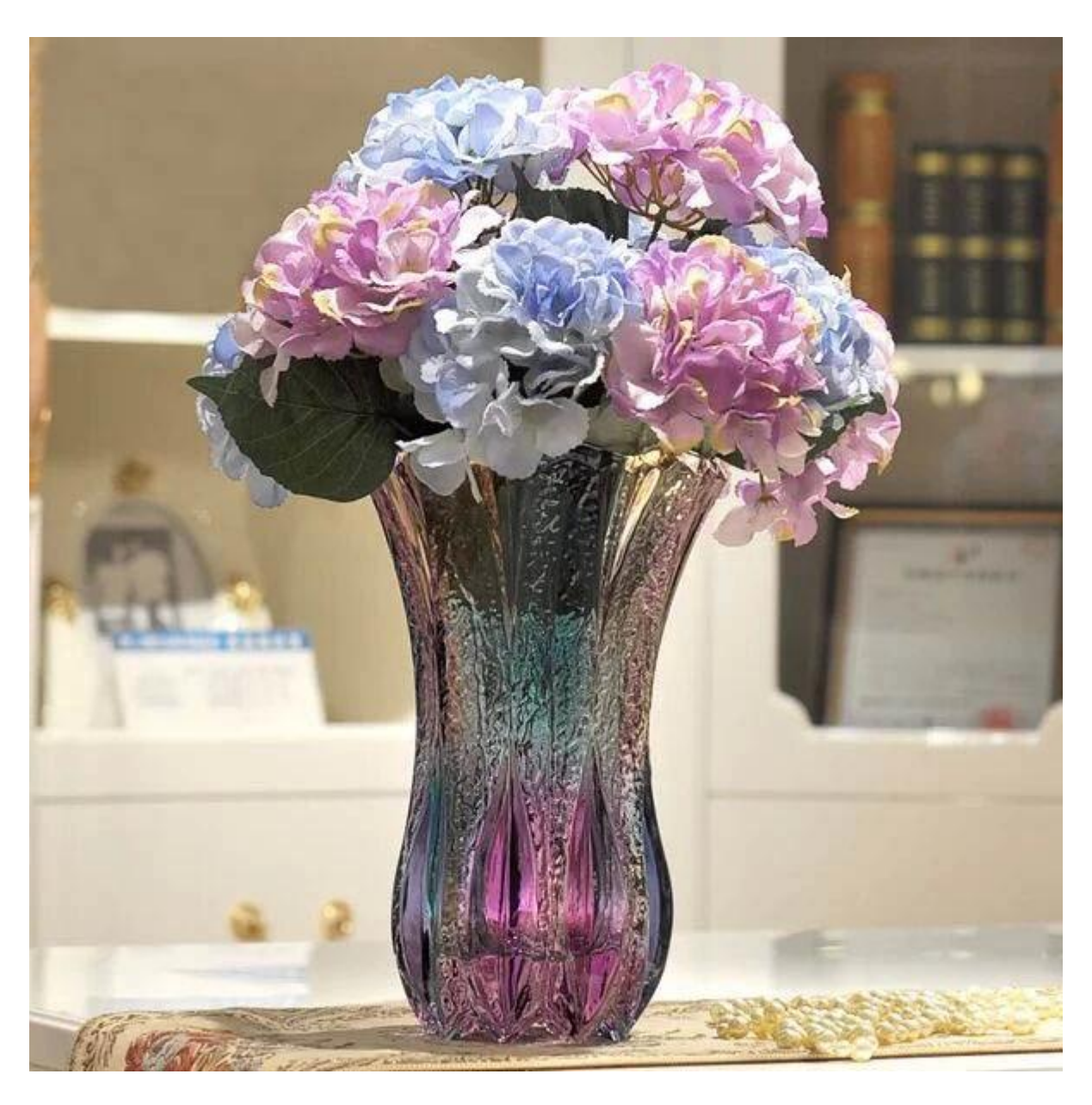
What are the glass vases applications?