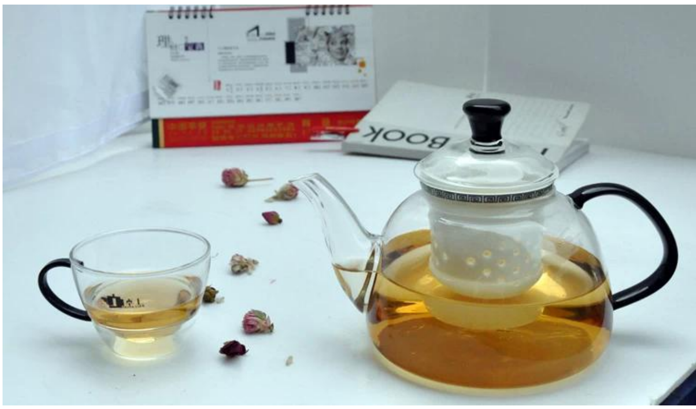
What are the borosilicate glass teapot applications?