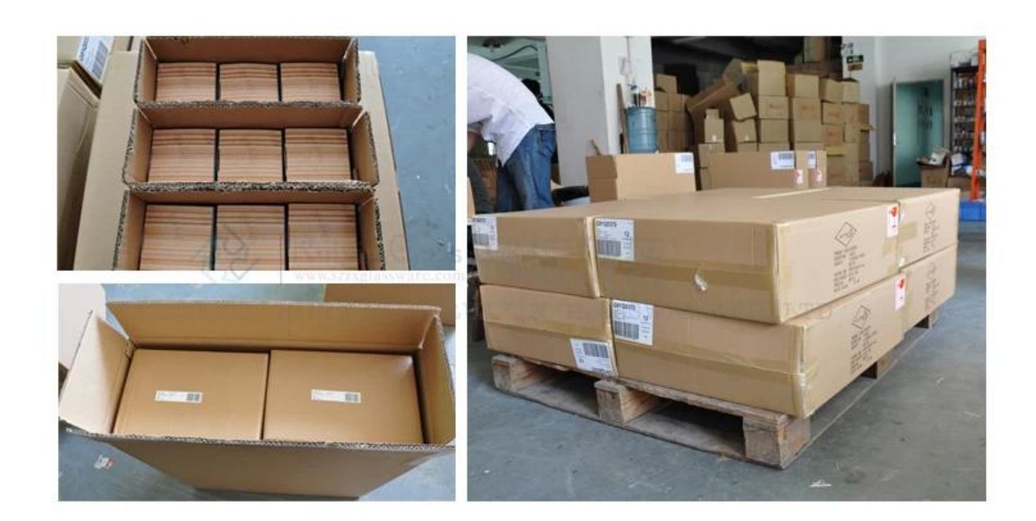
Why choose us?