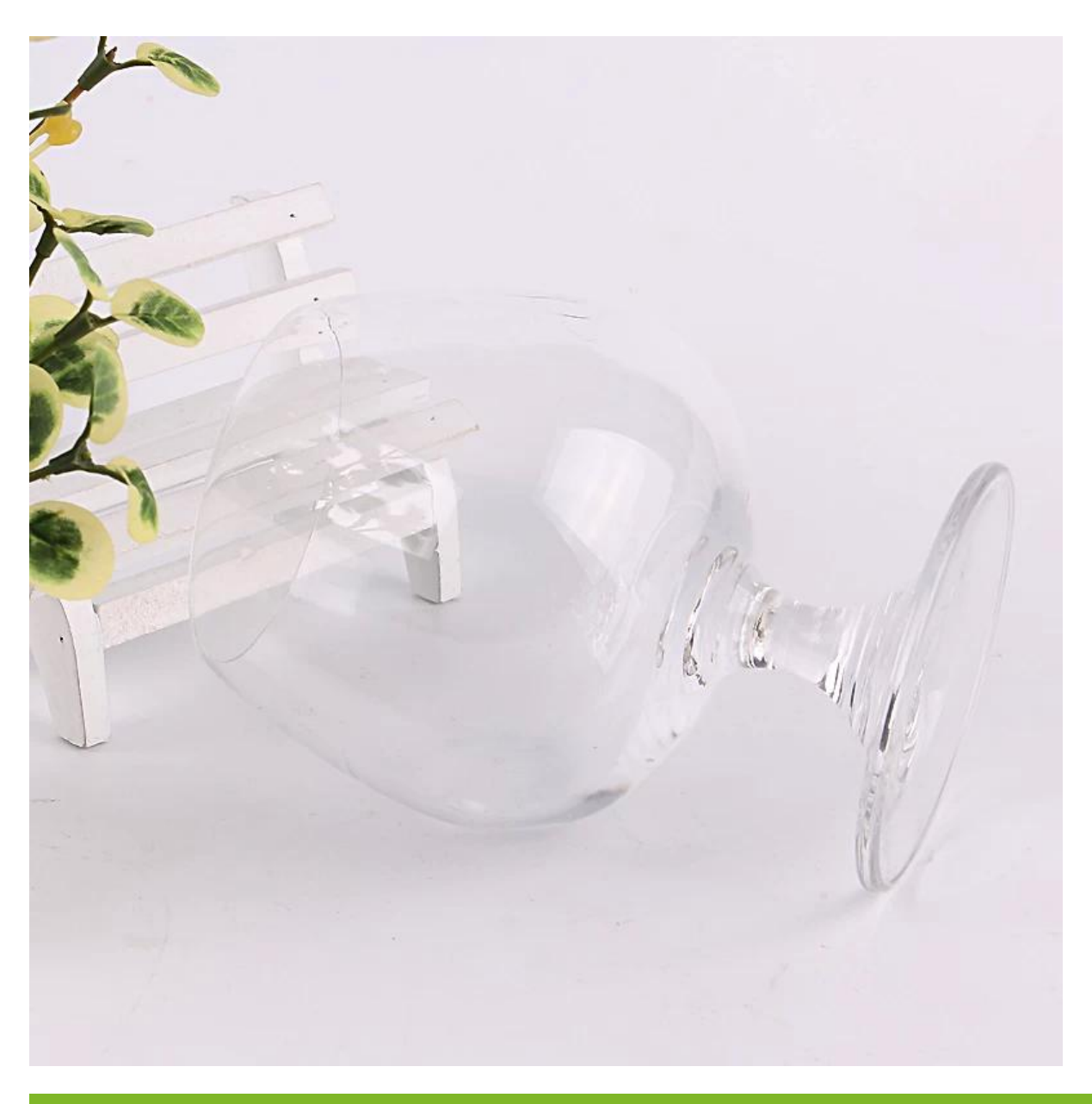
What are the brandy glasses applications?