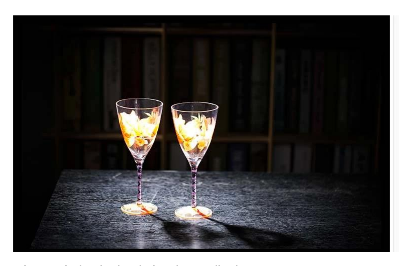
What are the hand painted wine glass applications?