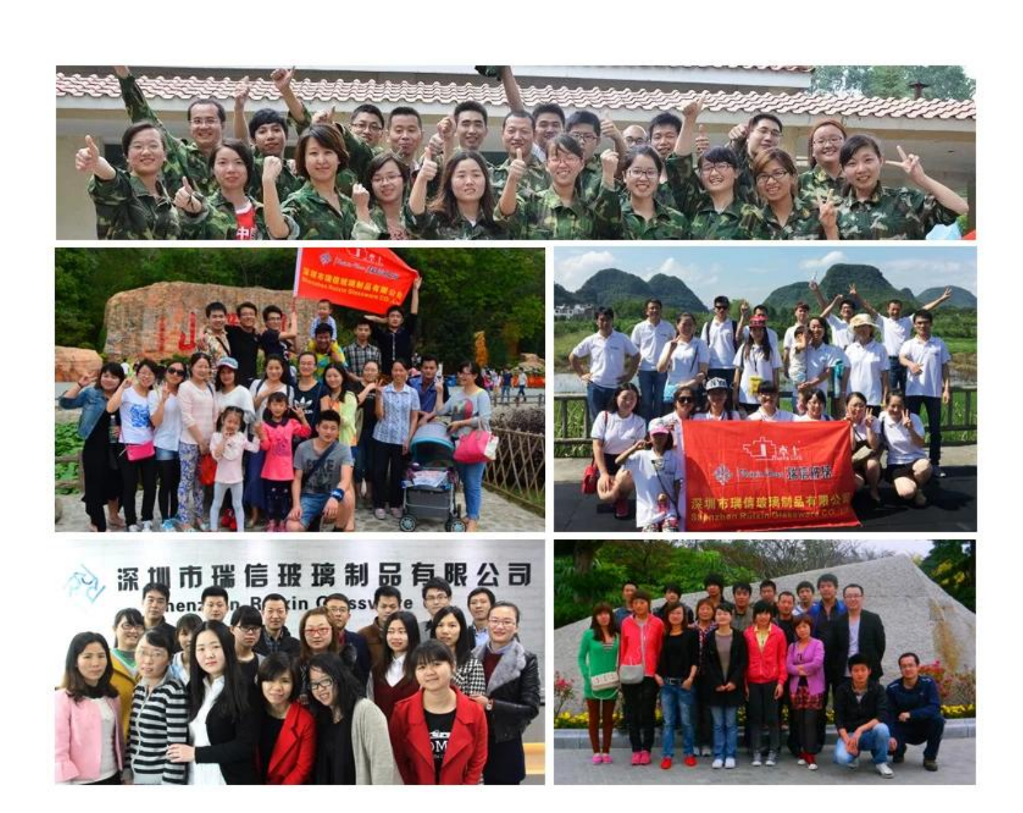
We are ready to serve you!