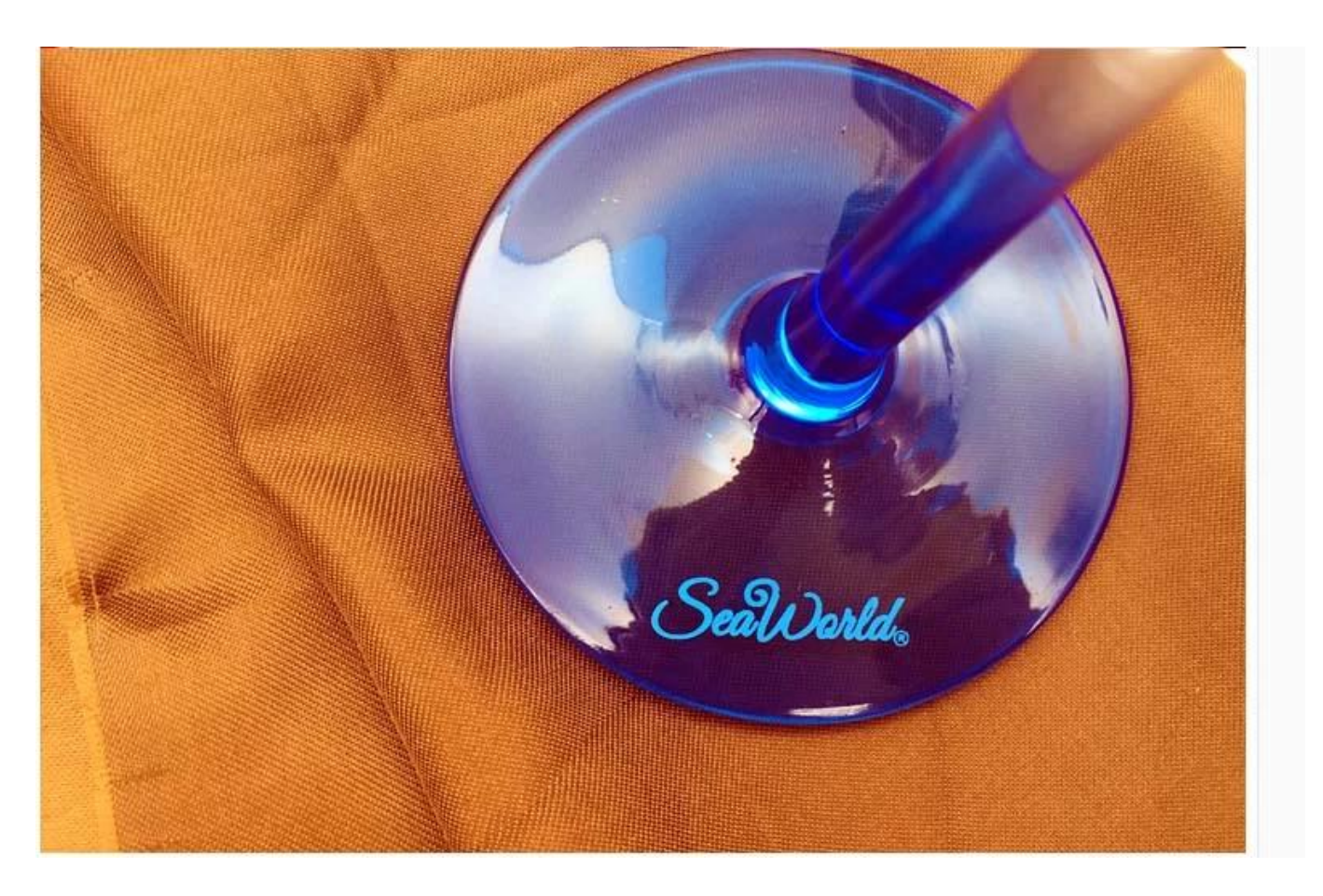
What are the hand painted martini glasses applications?