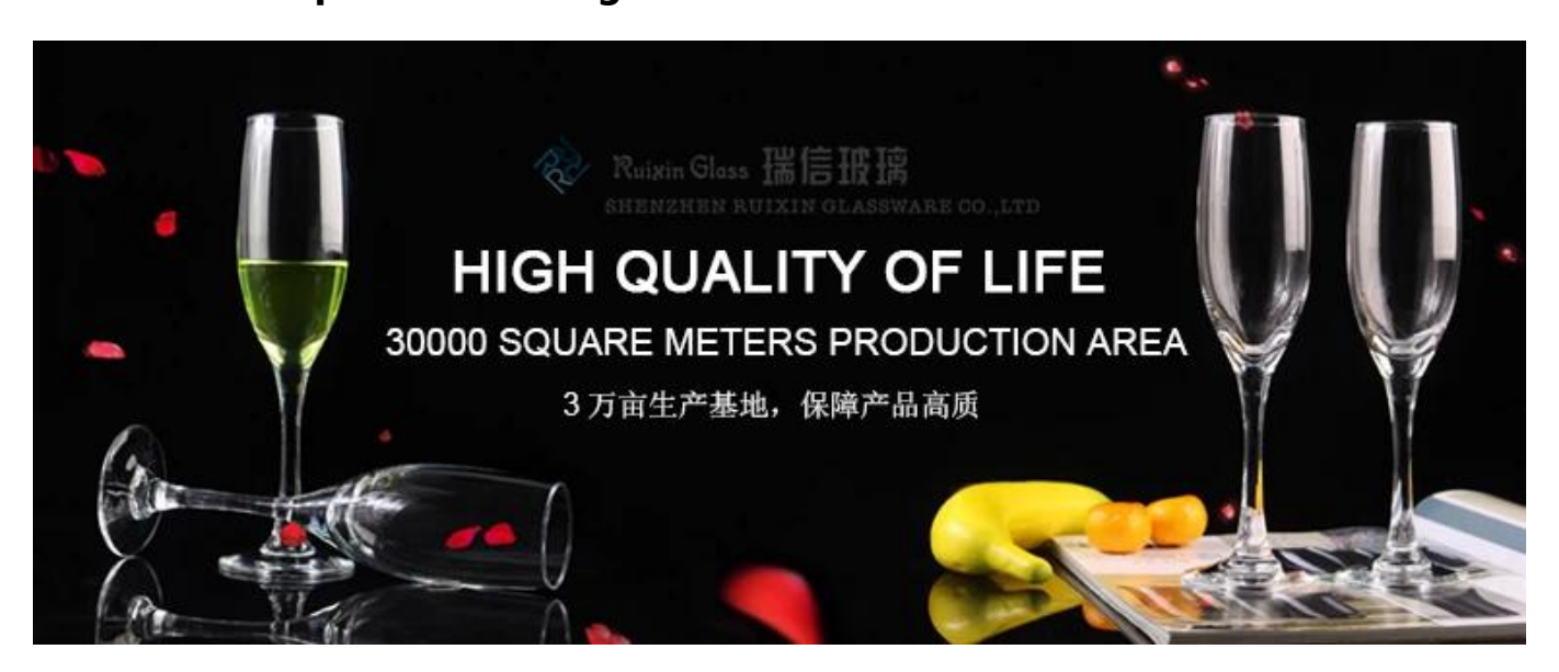
What are the features of hand painted martini glasses?