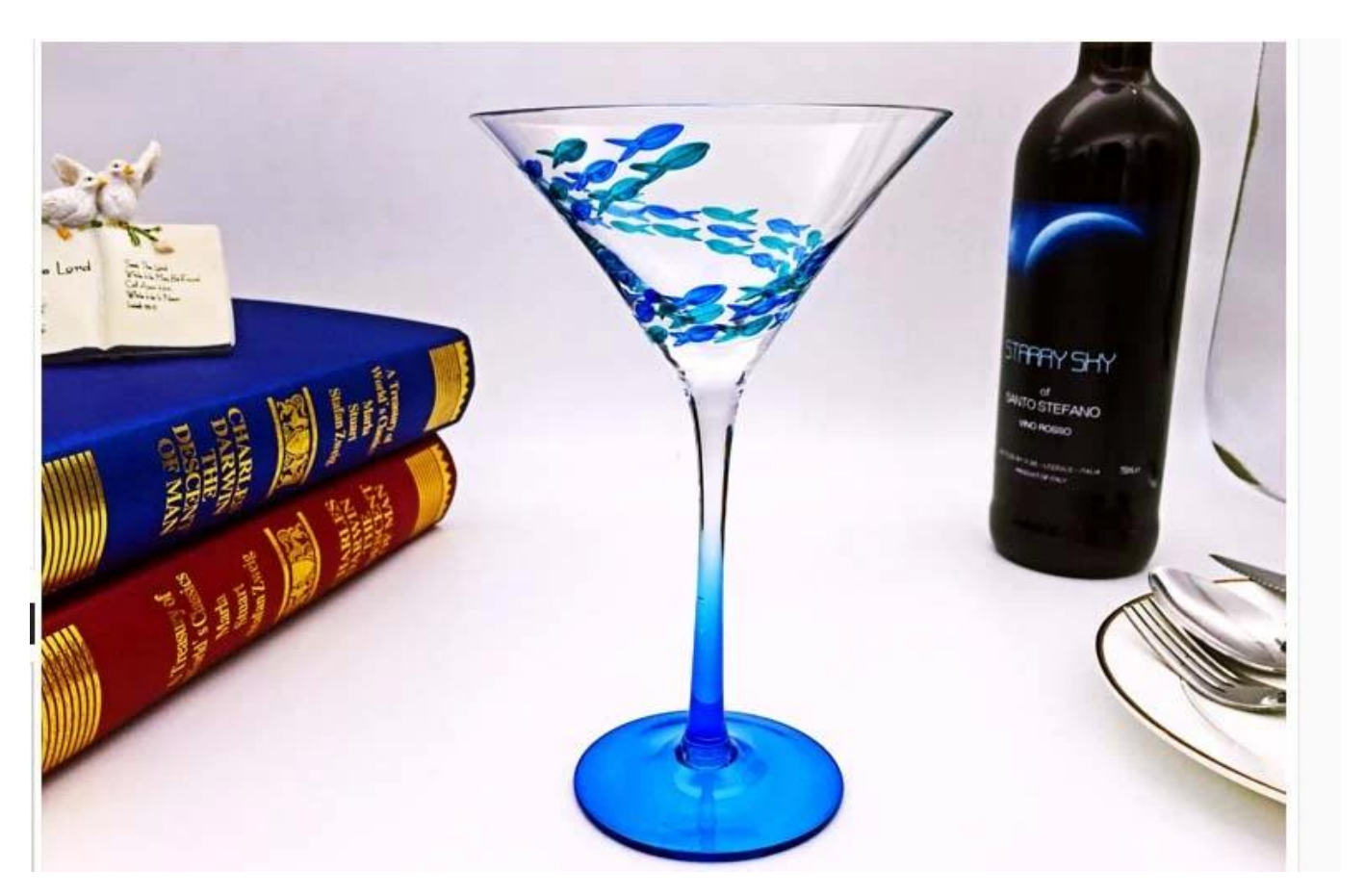
What are the functions of hand painted martini glasses?